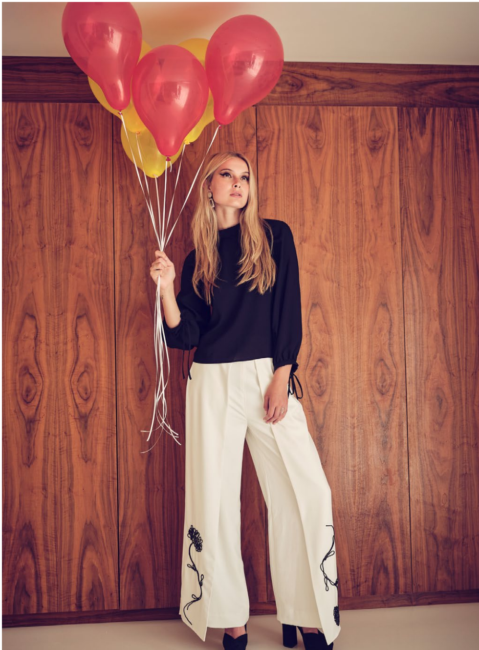
TPS2124 BETH TOP TRS2135 CURT TROUSER