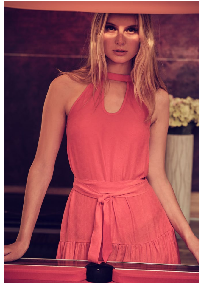
DRS2117 JANINE DRESS