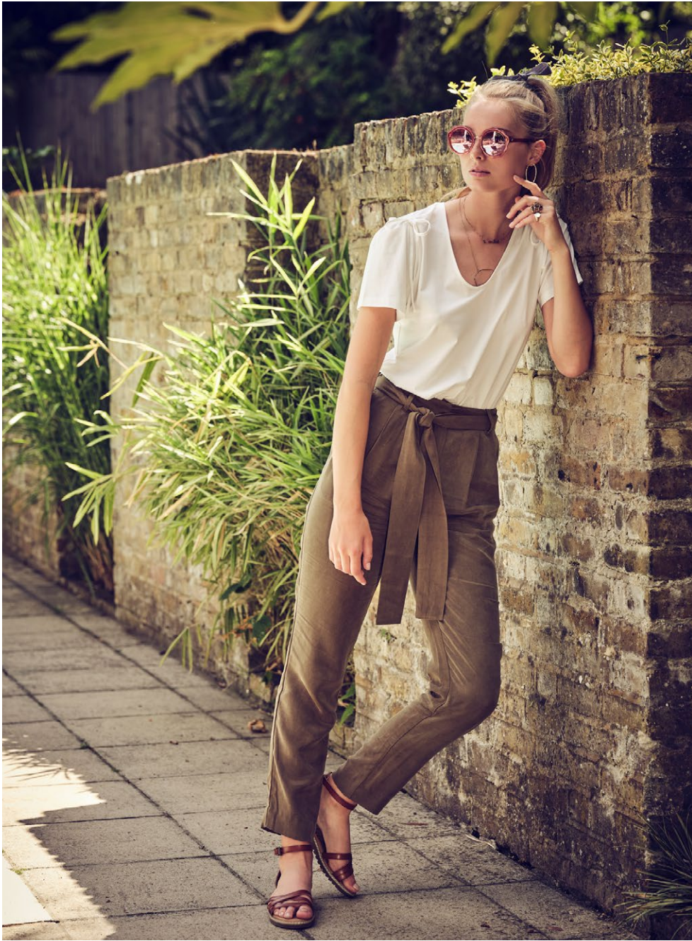
TPS2130 JEN TOP TRS2136 SIENNA TROUSERS