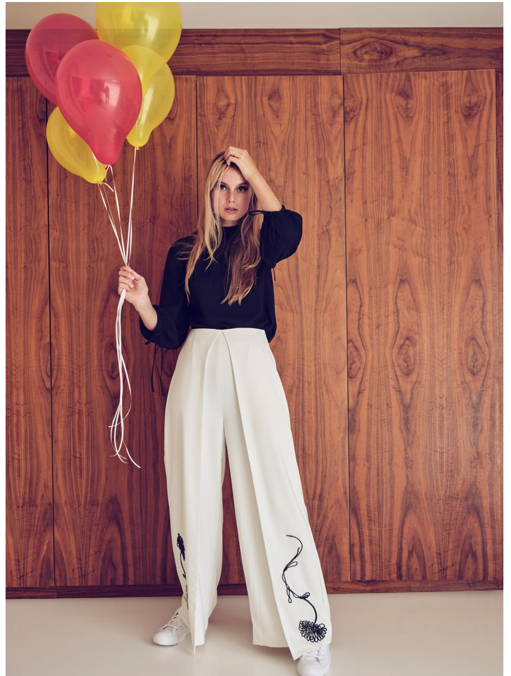
TPS2124 BETH TOP TRS2135 CURT TROUSER