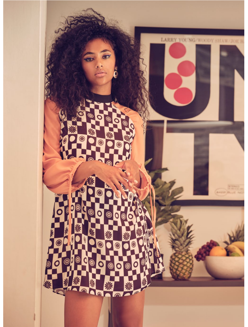
DRS2113 MAYUMI DRESS