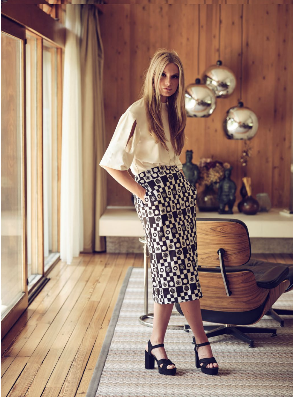
TPS2126 DEAN TEE SKS2163 DAWN SKIRT