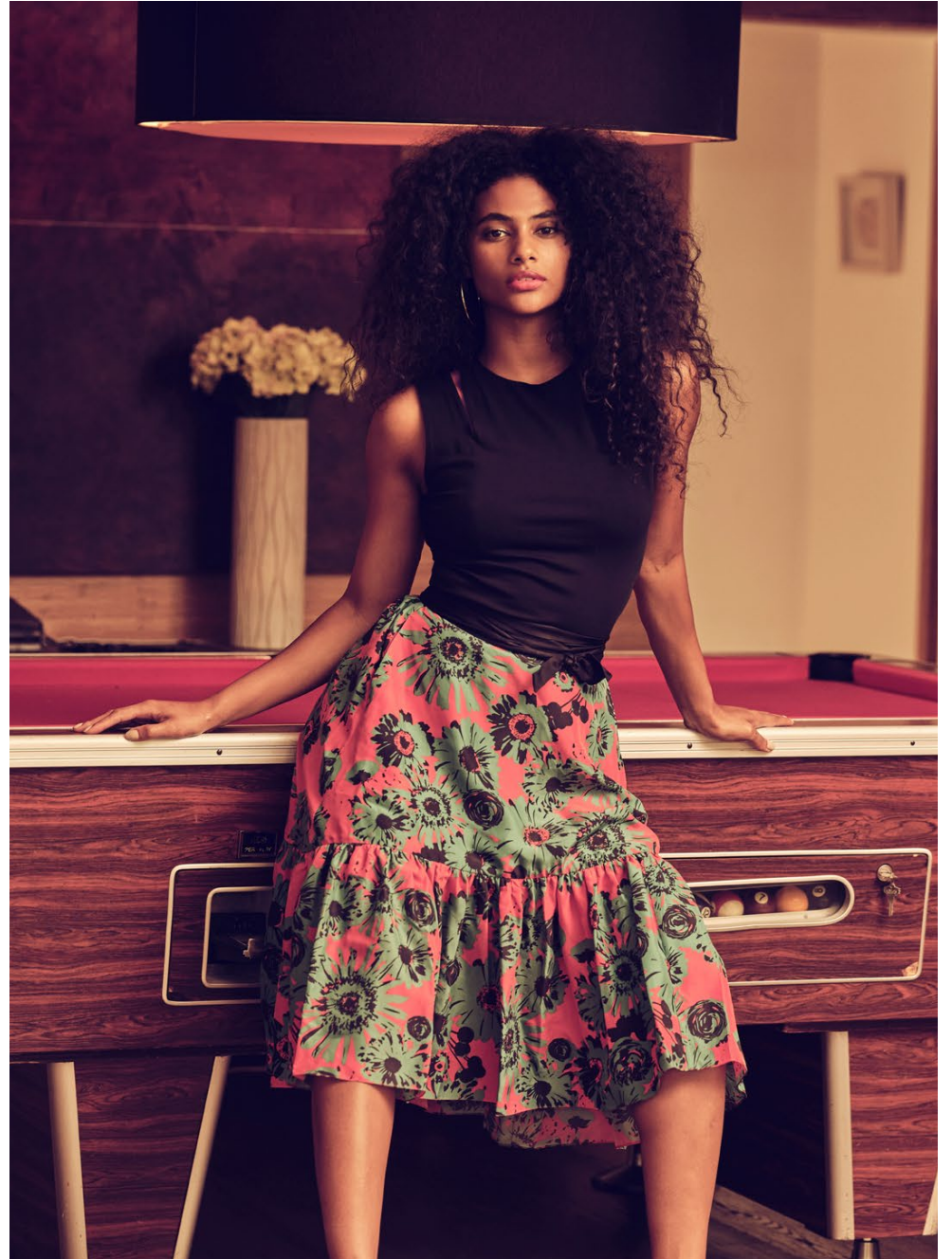
TPS2138B LISA TOP SKS2168 KATH SKIRT