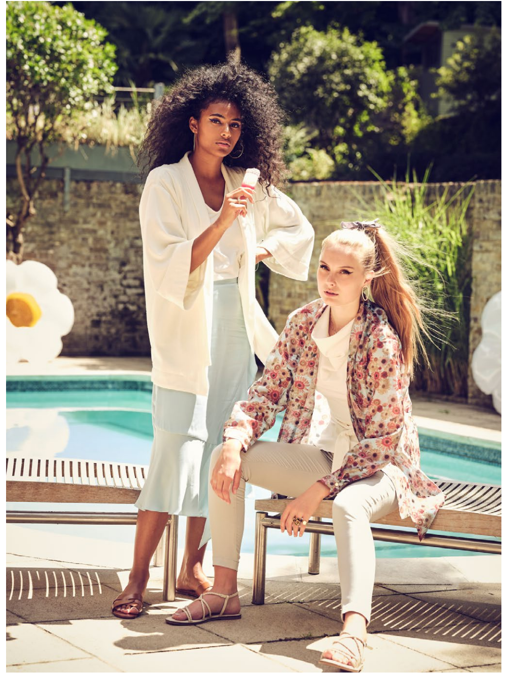
JKS2167 KIT CARDI TPS2130 JEN TOP SKS2166 MARTY SKIRT JKS2168 LORRIE SHIRT TPS2131W RONDA TOP TRS2137 ANNETTE JEAN