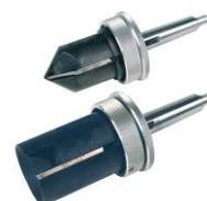
Deburring tools with adjustable depth stop