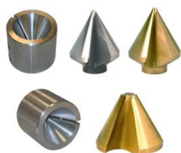
Special HSS deburring tools